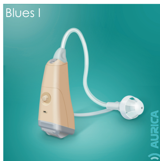
Digital 2-channels Hearing Aid with 4 memories for mild losses